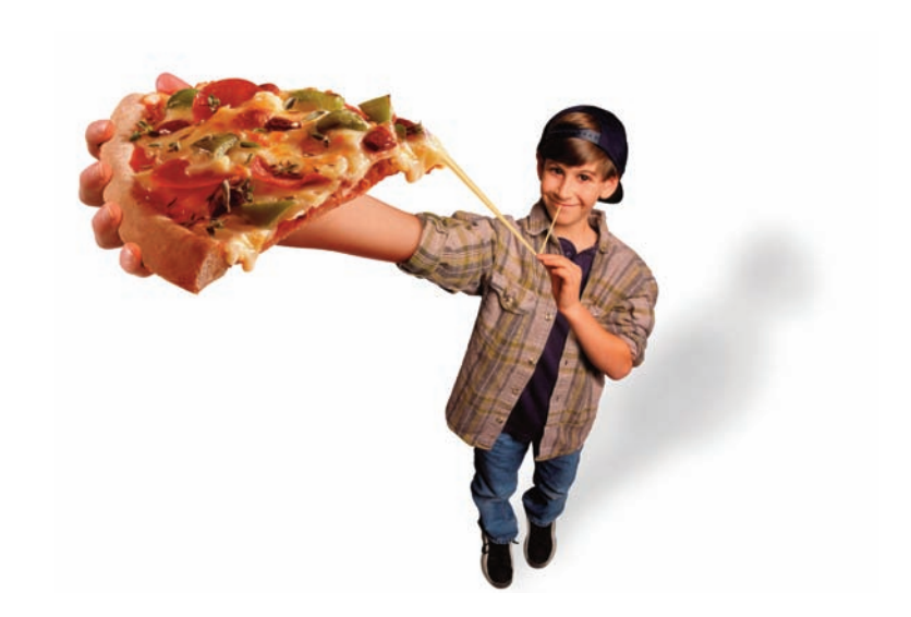
Deliver It Hot